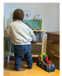
Visiting a young friend