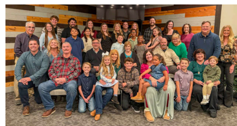
In January I was able to visit California to celebrate my Mom's 90th birthday