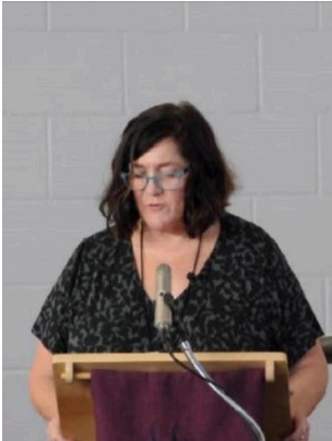
Preaching at the Nazarene Church