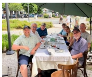
Greece May 30-June 10, 2022