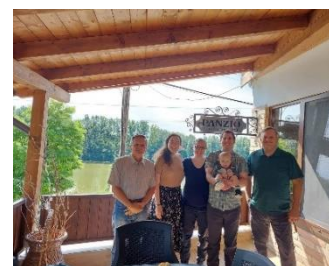
Eastern Europe June 15-22, 2022

Read about the remaining Luke 10 Exploration Trips planned for 2022 and how you can get involved in the Luke 10 Initiative on page 5. You can also learn more about the Five-Year Goal at friendsmission.com/five-year-goal/ .