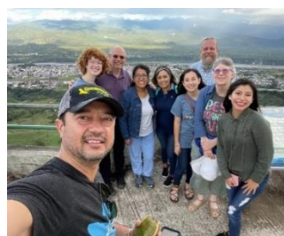
Shuar People of Ecuador May 30-June 16, 2022