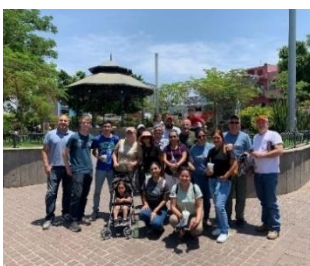
Mexico April 19- 29, 2022

Below are pictures from the first four Luke 10 Exploration Trips that have taken place this year.