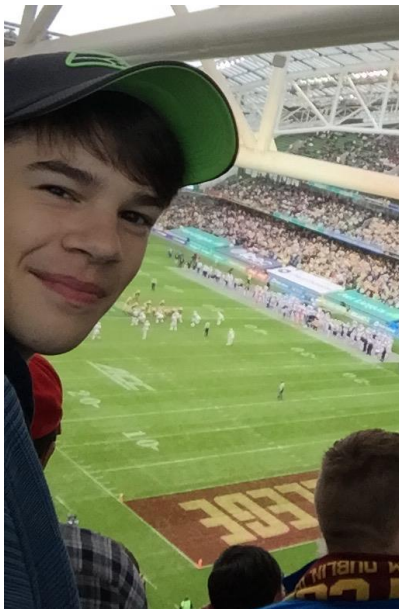
Watching Georgia Tech and Boston College play in Dublin